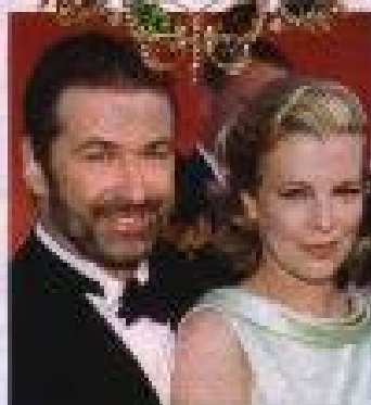
Alec Baldwin and Kim Basinger

Beyoncé, beware—your Destiny's Child pal Kelly Rowland is taking center stage. Rowland was a showstopper in a beaded and plunging Elio Saab gown at the Motown 45 Anniversary Celebration in Los Angeles.